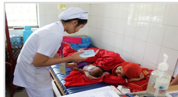
Nurses activities at RTC in Kampot province